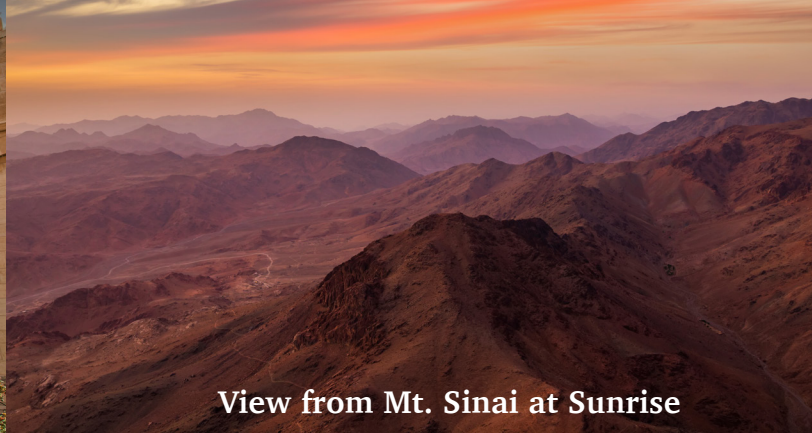
View from Mt. Sinai at Sunrise